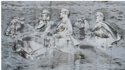
Carvings at Stone Mountain, Georgia Stonewall Jackson, Robert E. Lee, and Jefferson Davis

1861: Georgia seceded from the Union. Soldiers from Georgia served in both the Union and the Confederate Armies.